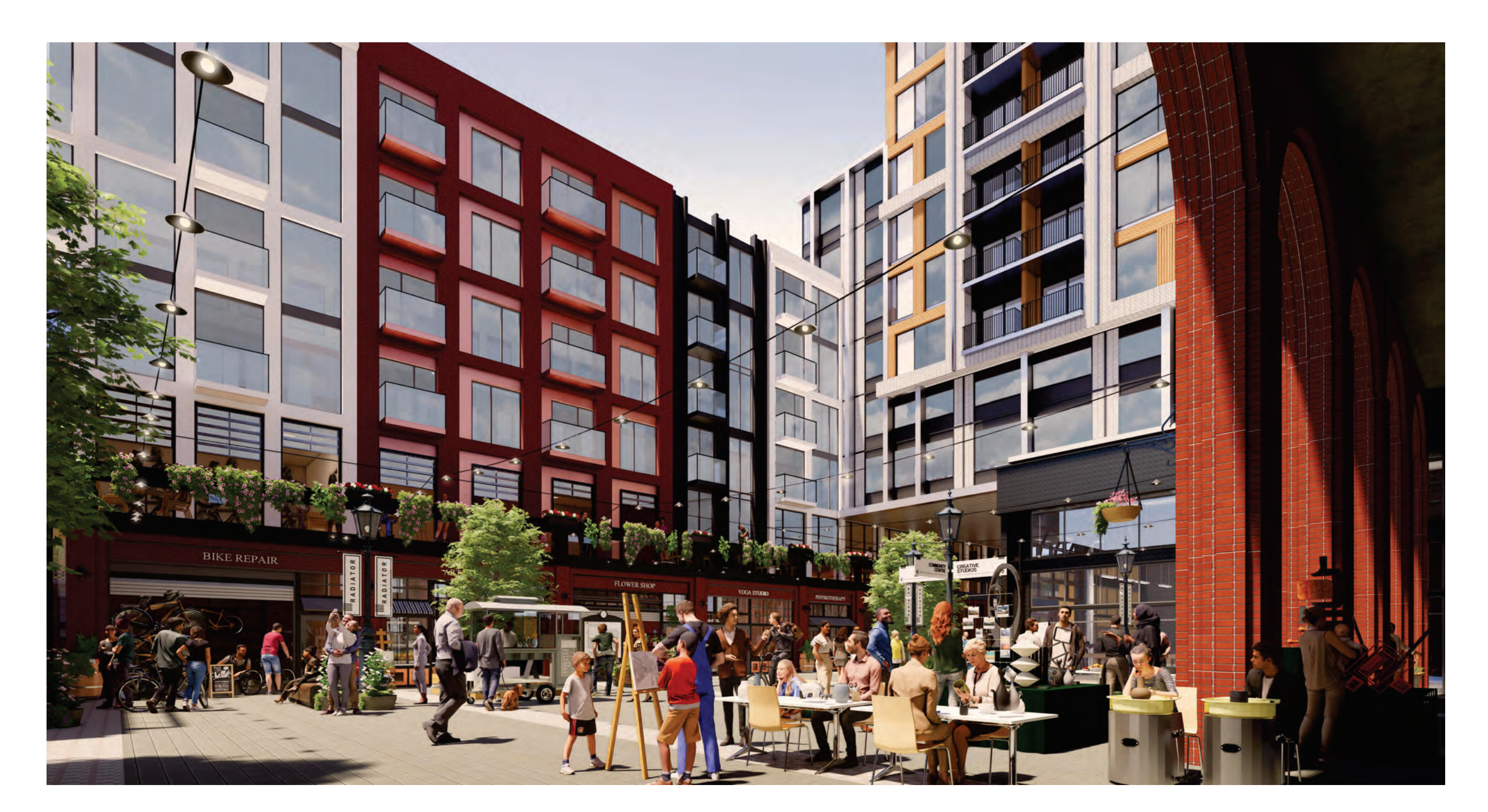
VIEW FROM COURTYARD LOOKING NORTH WEST