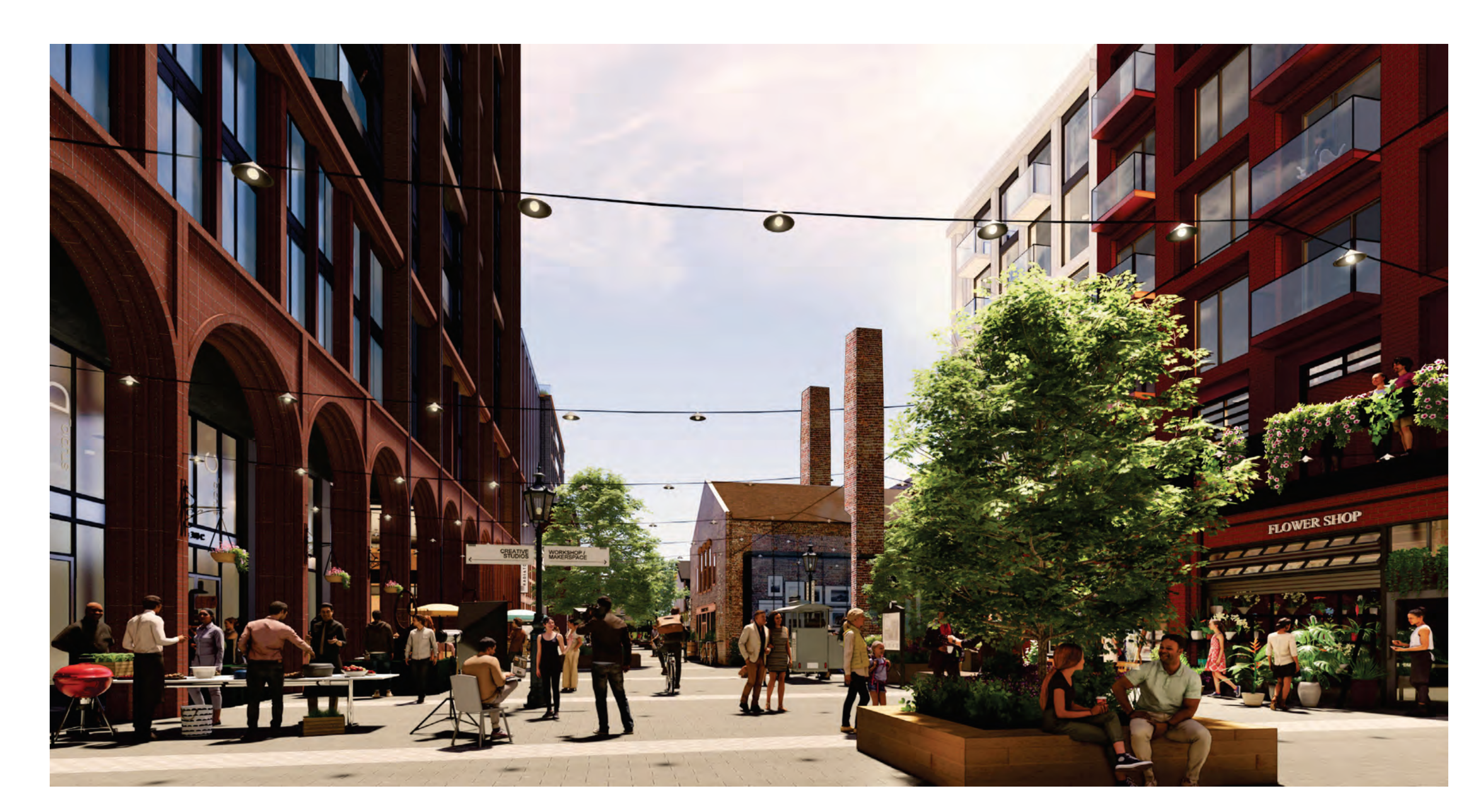
VIEW FROM COURTYARD LOOKING SOUTH